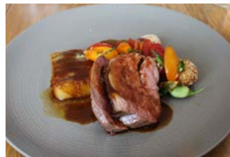
Barbecued rump of lamb