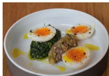
Wood pigeon tartare with quails egg and nettles