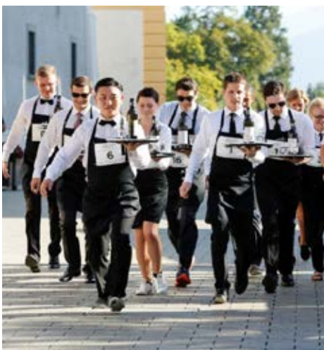
Young Sommelier's race