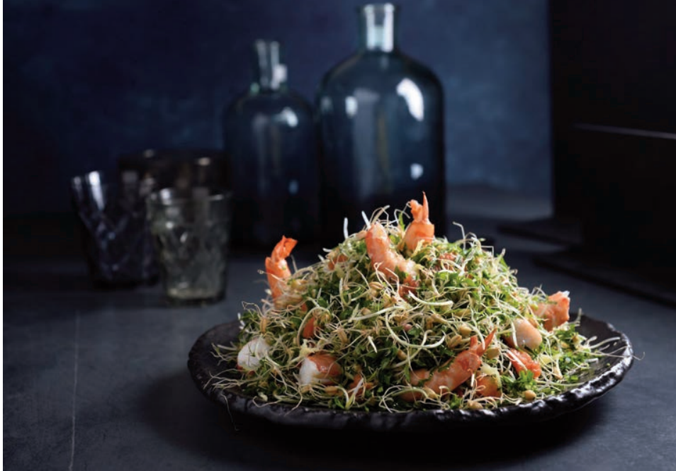
Tabboulet El Bahhar.