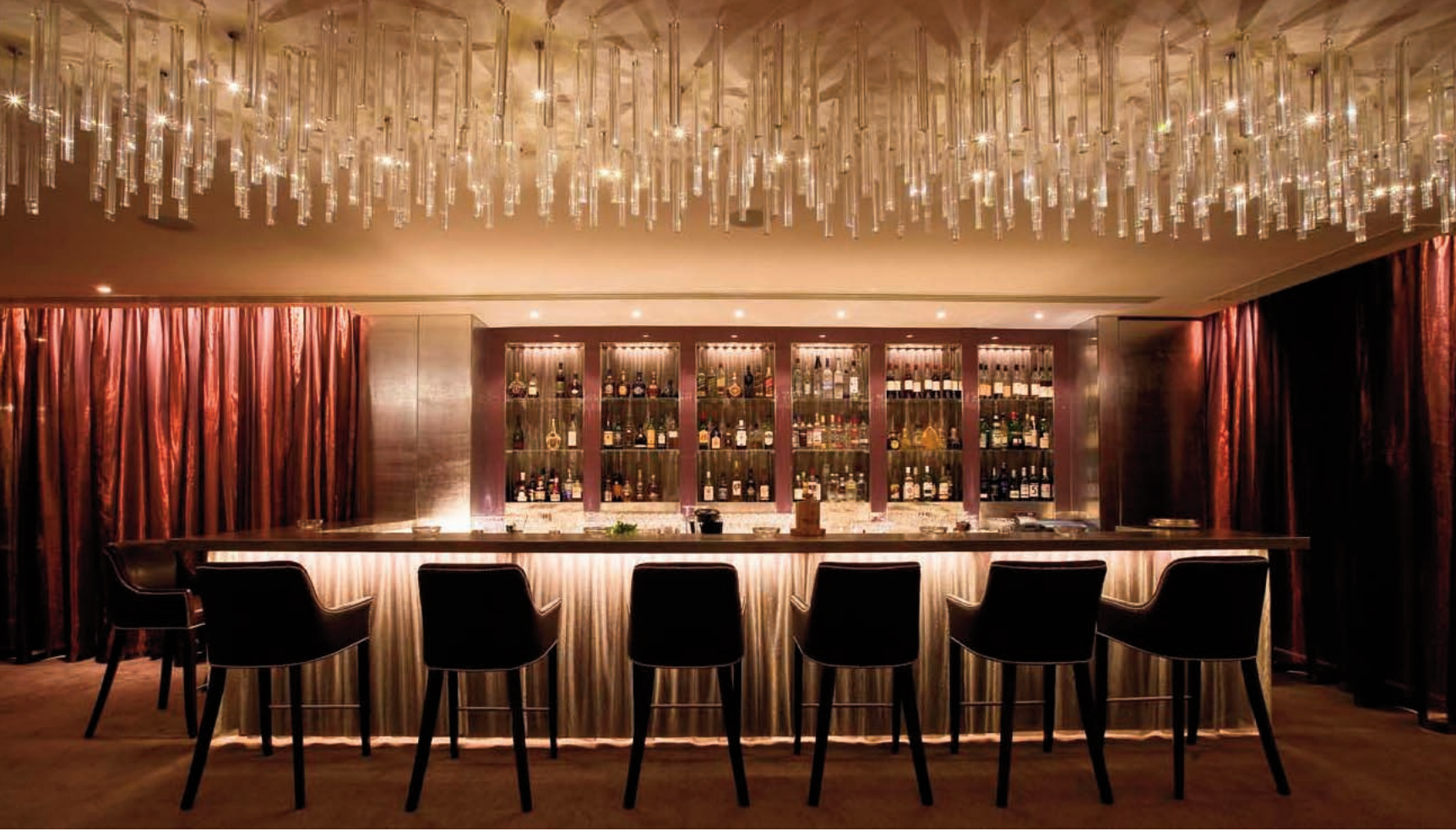
Bar du restaurant Eau de Vie.