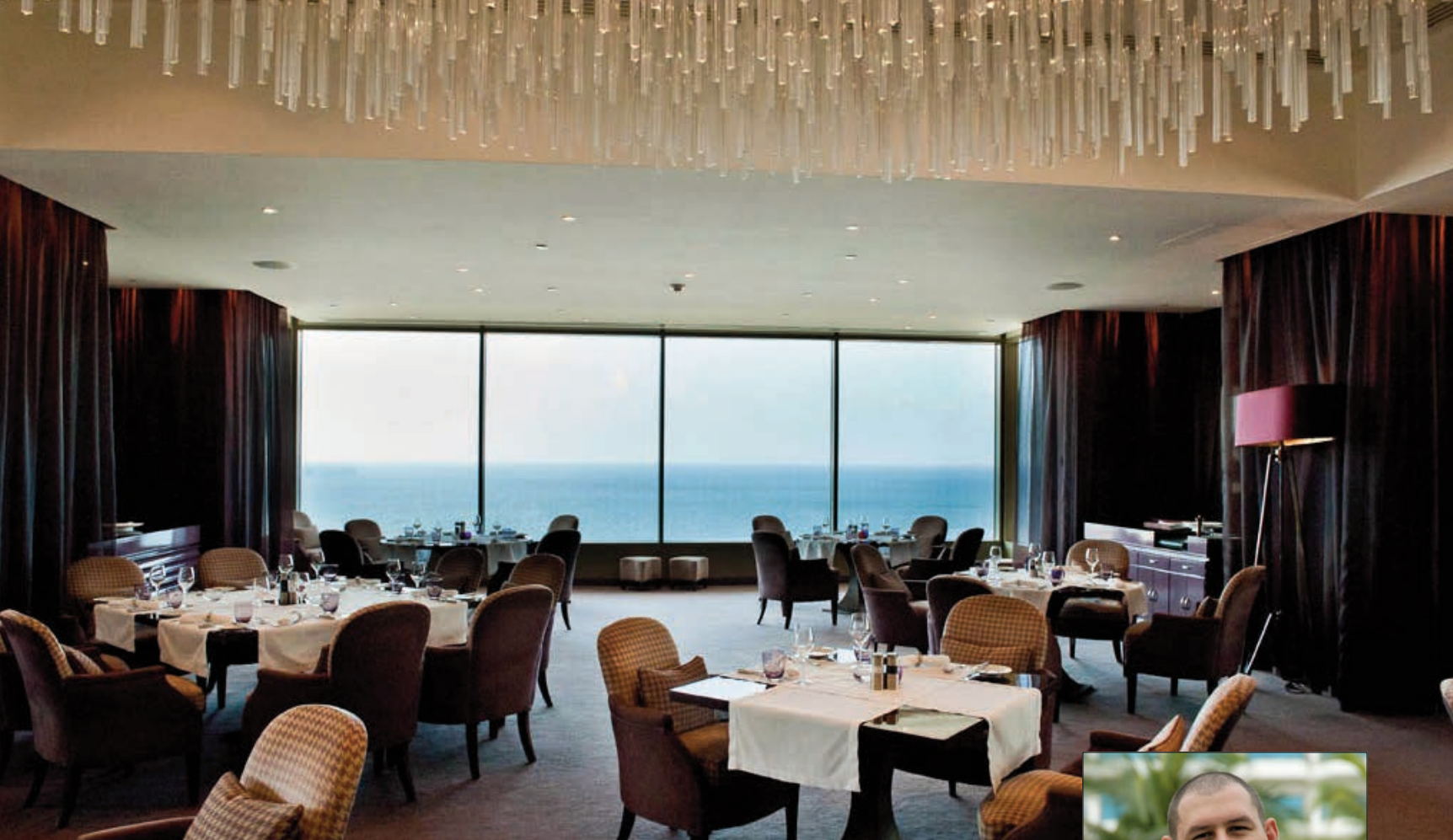
Restaurant Eau de Vie.