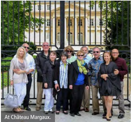
At Château Margaux.