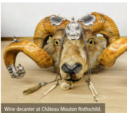
Wine decanter at Château Mouton Rothschild.