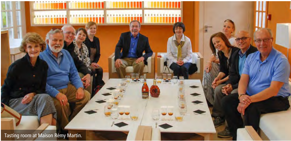
Tasting room at Maison Rémy Martin.

Monday brought tastings in the Médoc and Margaux—first at Château Kirwan and then at Château Giscours. Tuesday marked the spectacular finish, with a visit to Château Mouton Rothschild (complete with a tour of the original art featured on the labels), followed by tours of Châteaux Haut-Brion, St-Émilion, and Figeac. That evening, attendees adorned themselves in black tie and Chaîne ribbons for dinner at Le Chapon Fin, an exquisite Michelin-starred restaurant. Weary, but ever reluctant to leave, they departed for home the next morning. G