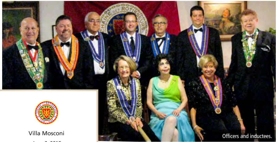
Officers and inductees.