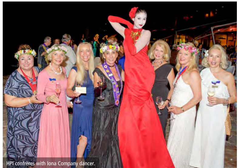
HPI confrères with Iona Company dancer.

During the day, confrères could enjoy the beaches, pools, or other resort amenities. On Saturday morning, regional officers and baillis attended a three-hour business meeting with Bailli